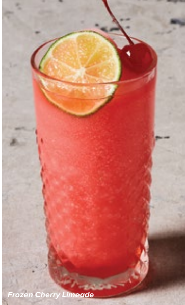
Frozen Cherry Limeade