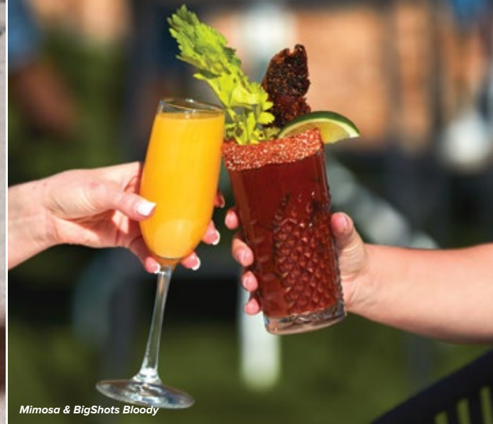
Mimosa & Big Shots Bloody