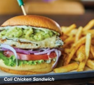
Cali Chicken Sandwich