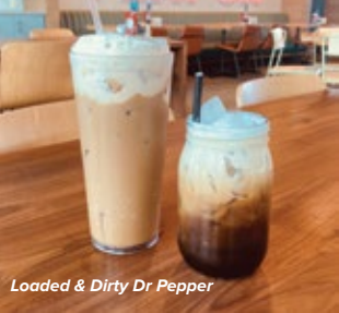
Loaded & Dirty Dr Pepper