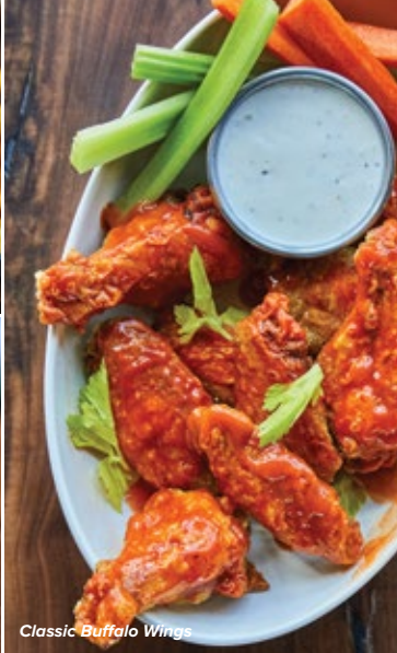
Classic Buffalo Wings